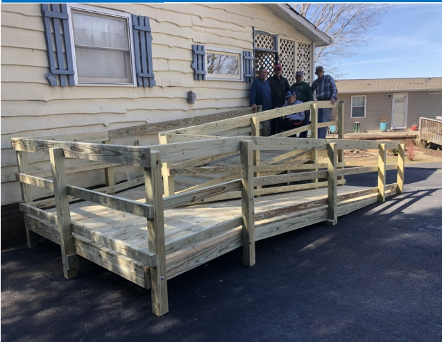
Warlicks Baptist Church

Cold and wet weather can't stop us or our Christ loving volunteers!!!