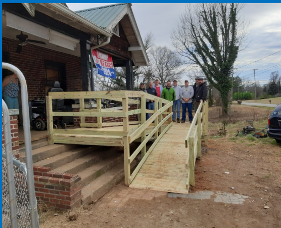
Union Grove Baptist Church