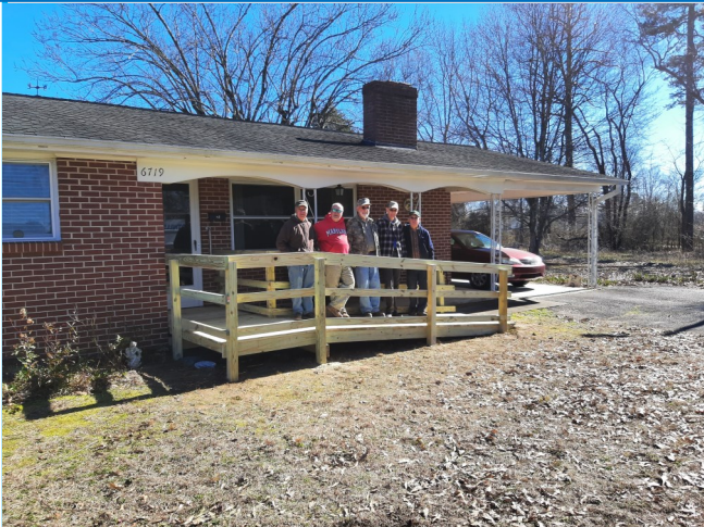
Alexander County Baptist Association