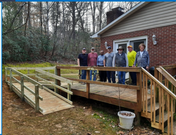
El Bethel Baptist Church