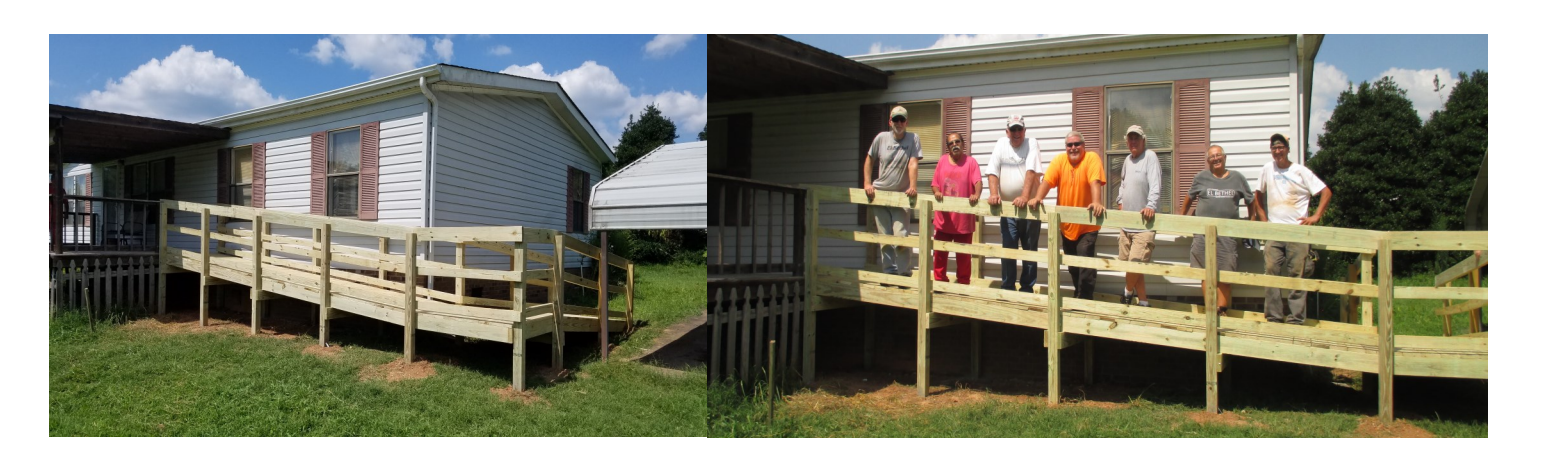
We are so blessed to have El Bethel Baptist Church volunteering with us every month now. These men not only work hard but are a blast to work with!

Our group of American Veterans complete multiple projects every month. These amazing men have been loval supporters of Foothills Service Project and the people of our community for twelve years now. They are an invaluable resource for us.