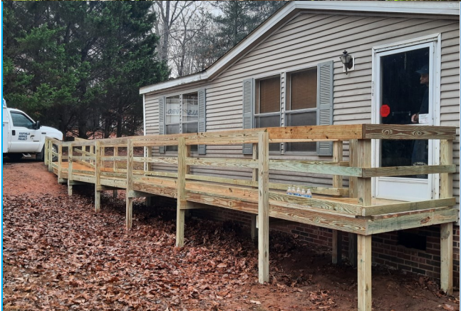
Blue Ridge Energy ← Willow Tree AME Brotherhood →