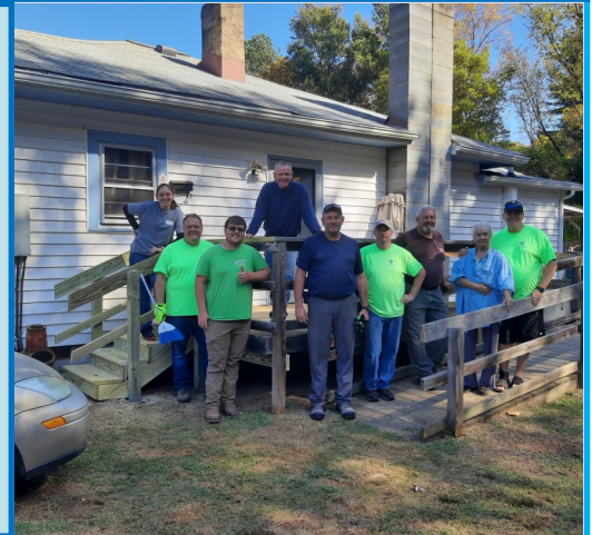
East Valdese Baptist →