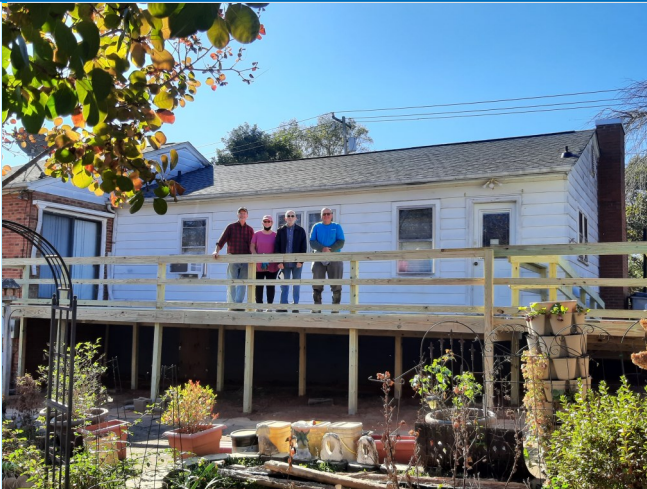
Caldwell Baptist Association ←