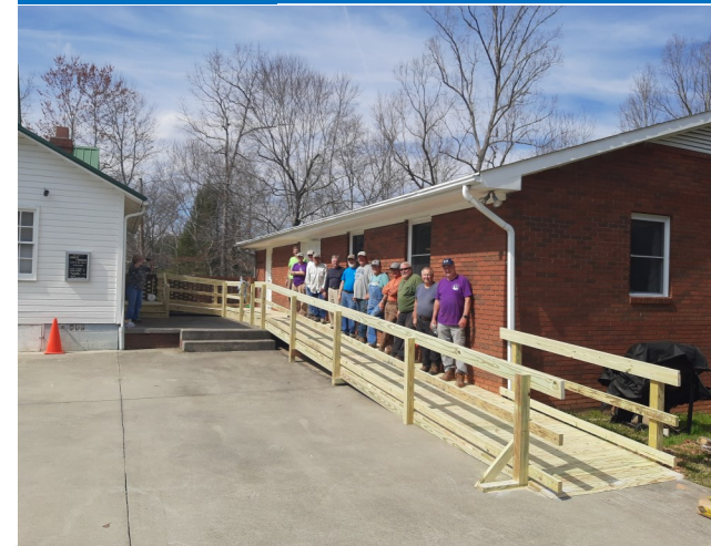
First Baptist Morganton and El Bethel Baptist ←

It's the perfect time of year to plant the seeds of God's love in our community!