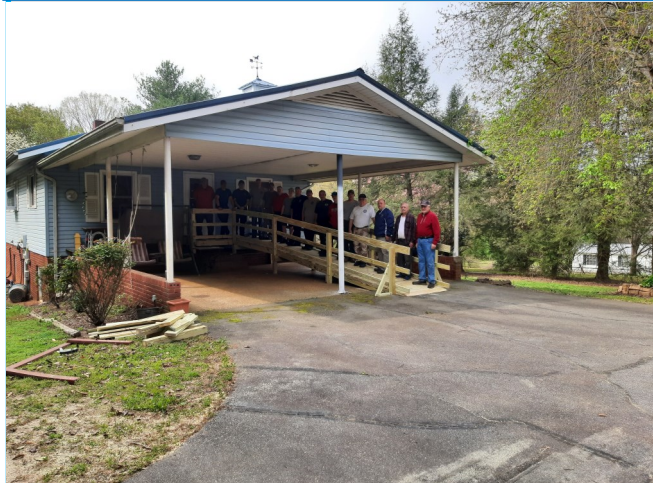
North Catawba Fire Depatmen ←