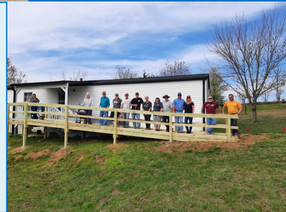
Western Piedmont Council of Governments ←